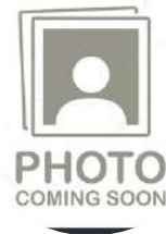
PHOTO COMING SOON